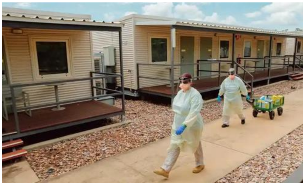
Howard Springs Quarantine Facility has capacity for 2,000 overseas arrivals and about 1,000 domestic travellers.

The Australian army has begun forcibly removing residents in the Northern Territories to the Howard Springs quarantine camp located in Darwin, after nine new Covid-19 cases were identified in the community of Binjari. The move comes after hard lockdowns were instituted in the communities of both Binjari and nearby Rockhole on Saturday night.